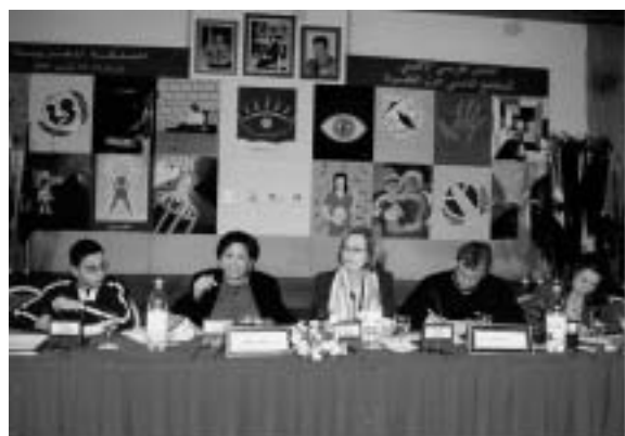
Civil Society Forum, Morocco

After examining the achievements for children in region over the last decade, the Forum looked at issues relating to children's development. Participants developed frameworks for action, set priorities for the region, and identified mechanisms to improve the state of children in the Arab countries in the light