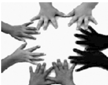
Logo of the Berlin Conference on Children in Europe and Central Asia

Germany, 16-18 May 2001 – For the first time, representatives of more than 50 European and Central Asian countries and the Holy See gathered in Berlin in May to create a new agenda for children: The Berlin Commitment. The Commitment outlines priority goals for child well-being in these countries for the next decade. The diversity of the countries represented made the meeting unique in its scope, including well-established market economies, those seeking admission into Western European institutions, and others that face basic child survival and development problems in the face of growing poverty. In addition, conflict in 11 countries in the region in recent years has caused immense upheaval, with children and women bearing the brunt.