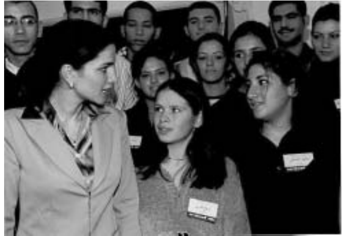
Queen Rania Al-Abdallah of Jordan, under whose patronage the Forum was held, with some of the youth participants.

made specific recommendations on the problems surrounding their education, health, employment, relationships with adults, the role of boys in society, media perceptions of youth and young people in violent situations. The young people came together at the Regional Youth Forum in Amman last November, held under the patronage of Jordan's Queen Rania, a