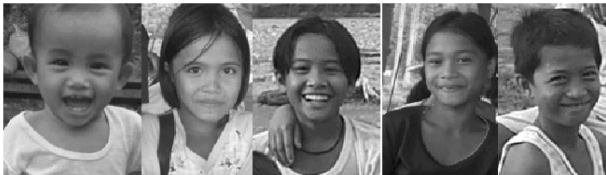
Photo used for the launching of "Say Yes for Children Campaign", Manila, Philippines.

The children also asked NGOs to support government-initiated programmes for children and organize their own efforts to promote and protect children's rights.