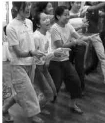
Vientiane/Lao PDR/photo 01.jpg

The symposium was organized by the UNICEF Regional Office for South Asia, the Pakistan UNICEF Country Office and the Government of Pakistan.